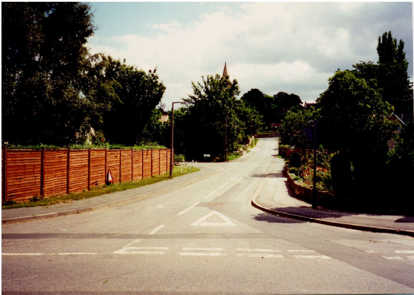
New Road in the 1990's.